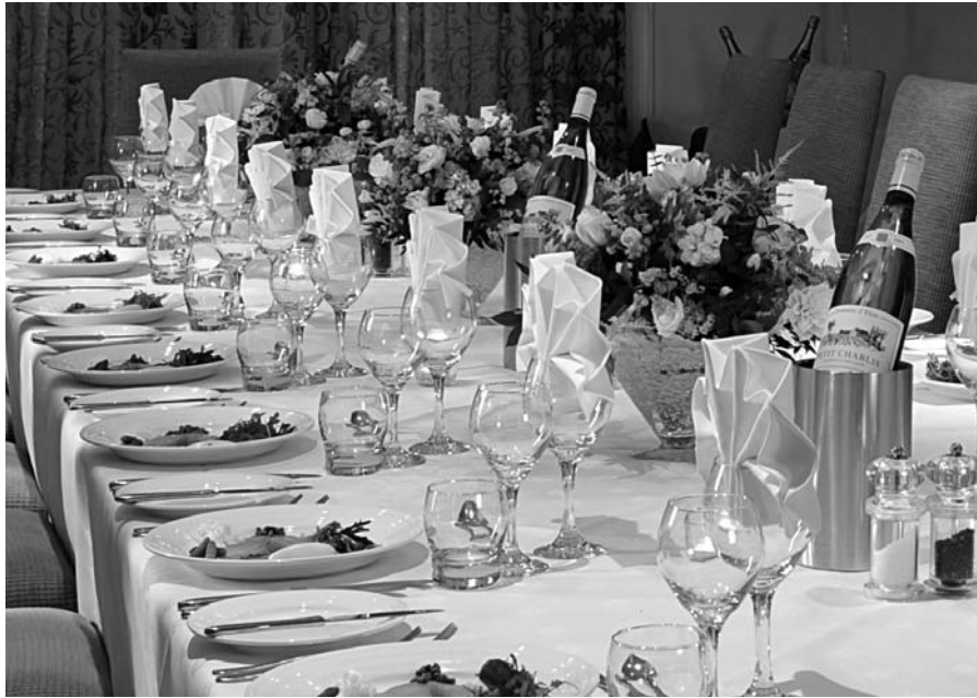
An intimate occasion